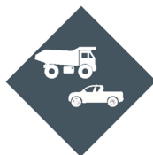
WORKING WITH MOBILE PLANT & VEHICLES