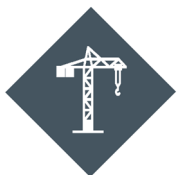
CRANES & LIFTING EQUIPMENT