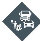
WORKING WITH LIVE TRAFFIC