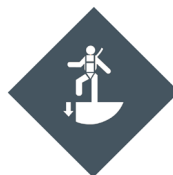
WORKING AT HEIGHTS