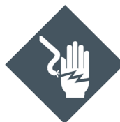
WORKING WITH ELECTRICITY