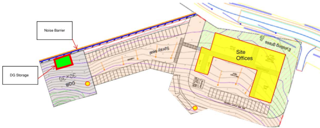
Figure 1: Location of chemical storage on ancillary facility C8