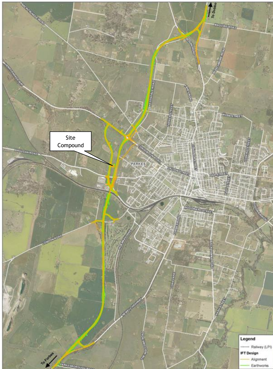
Figure 1- Project Location